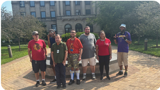
The Lincoln Park Zoo

CRS Choice participants kept very busy during the month of August. They took part in a wide variety of on-site activities and classes like cooking, dance, karaoke, knitting, art, and different games. Community outings continue to be very popular among participants, and there were many opportunities to explore the Chicagoland area. Highlights for the month included trips to the Lincoln Park Zoo, the movies theater, the Nature Museum, Navy Pier, and the Edgewater Athletic club for the Movement and Motion Class. Participants are eager for upcoming fall events.