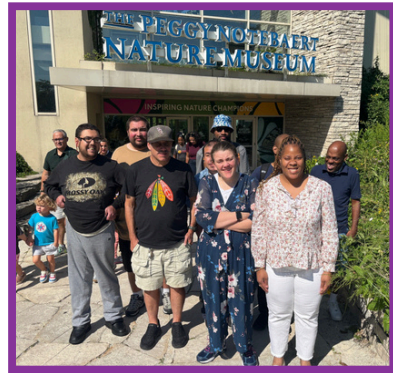
The Nature Museum